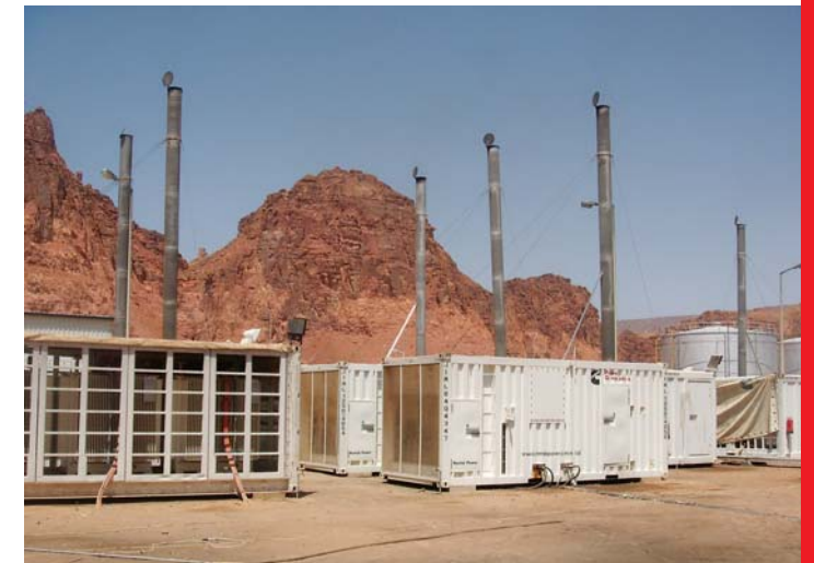
Prime power for a 65 MW power plant at Ula, Saudi Arabia

To meet the increasing demand for electricity, the PowerBox 20X unit comes in a standard ISO container for easy transportation across borders and regions. The CSC certified modules can be shipped around the world like regular containers, which means lower freight and transportation costs.